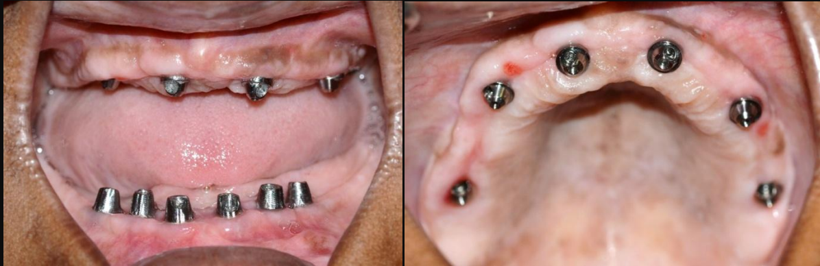
Fig.1-Implants in the Upper and lower jaws fig. 2- Upper implants before fixing teeth set

Case-1 50 year old female edentulous Patient wearing removable complete dentures since 12 years wished to have all fixed teeth on implants