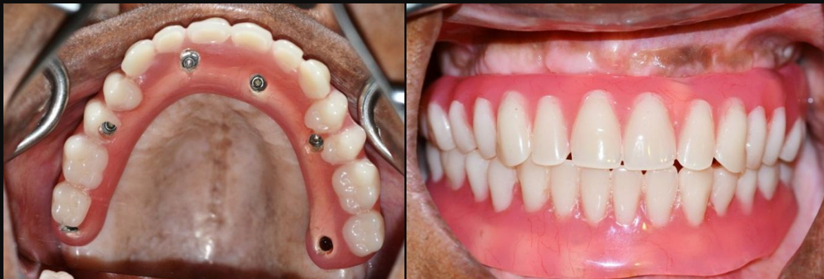
Fig.3-Upper teeth set fixed over the implants fig.4- Upper and lower teeth sets fixed over the implants