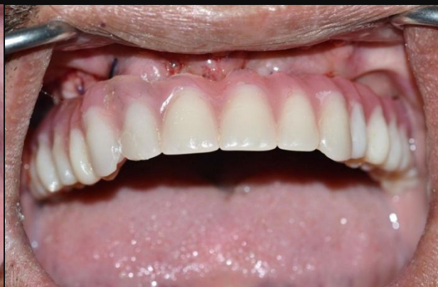
Fig.3-Upper teeth extracted and implants inserted fig.4. The prefabricated teeth set is fixed over the implants at the same day /same sitting.