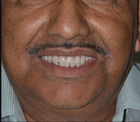
Fig.7- patient left the clinic with the upper and lower fixed teeth with all on 4 technique.

Fig.5-Lower implants inserted fig.6-Prefabricated teeth set is fixed over the implants at the same day /same sitting.