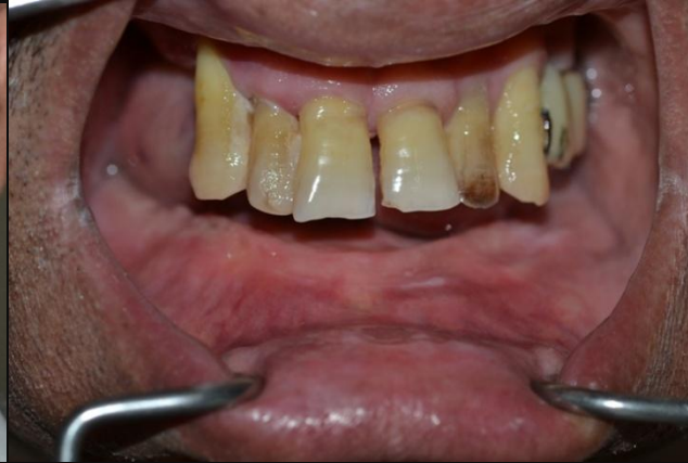
Fig.1 At the time of consultation, before the all on 4 procedure fig.2. Upper mobile teeth and lower all missing teeth